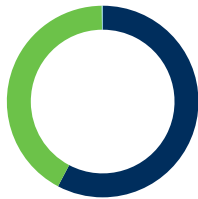
Asset mix (%)