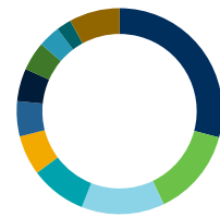
Country mix (%)