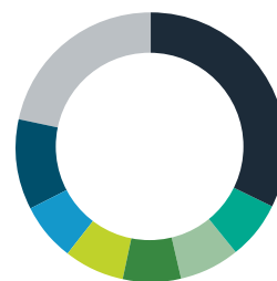
Fama and French account for additional factors: size and style