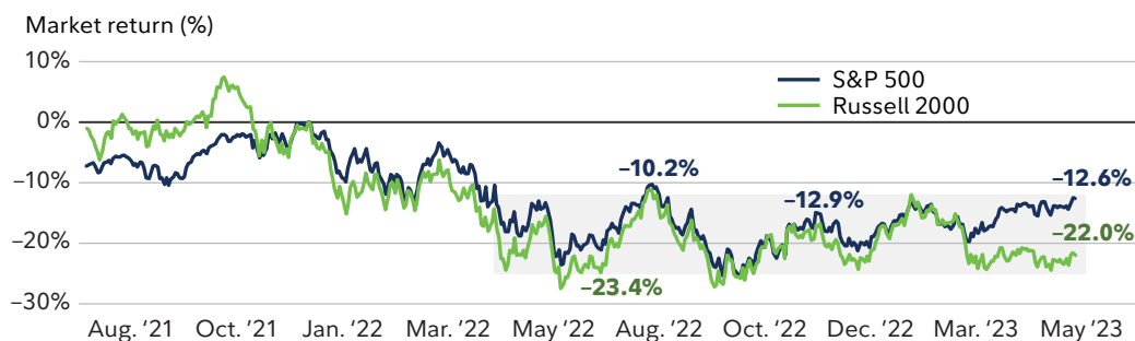
EXHIBIT 1: The market has spent a year in limbo

The stock market has been essentially directionless since June of last year. That's a long time to be in limbo, and it makes me wonder whether the strength in the S&P 500® in recent weeks could indicate that the next (or current) bull market is finally declaring itself.